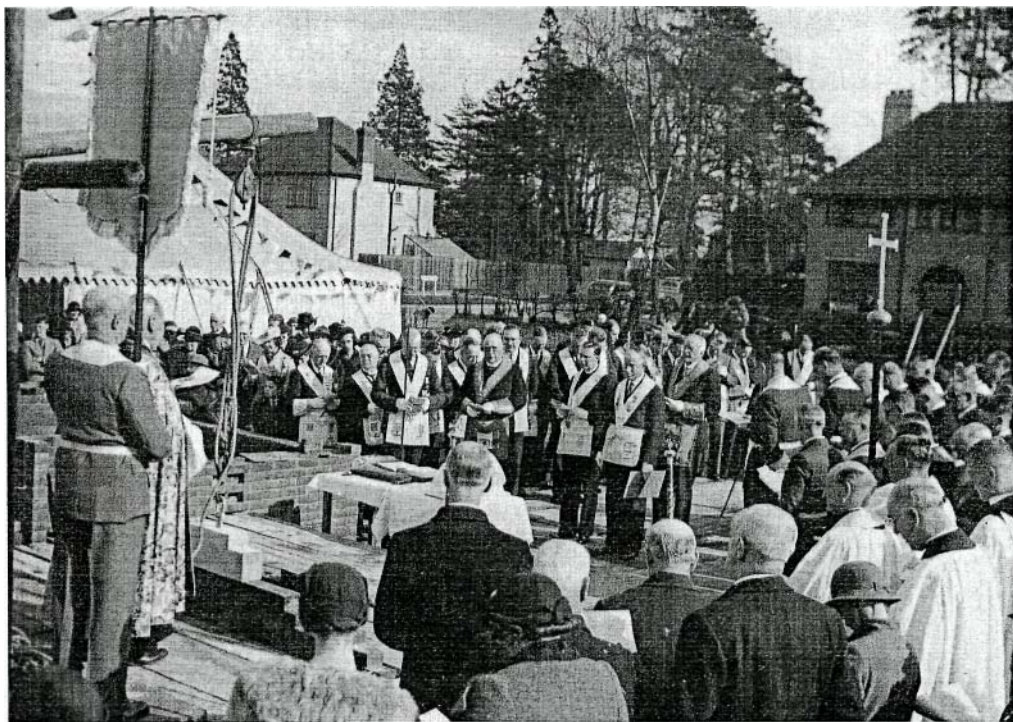
The laying of the foundation stone, Banstead Vicarage, 3 April 1937